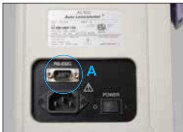
AL500 w/ serial port shown

The AL500 Auto Lensometer® can use either the Adapter Set or the Extension Cable configuration to connect to the Wireless Dongle Kit. The serial port ( A ) on the side of the AL500 is where the Wireless Dongle will connect. In both configurations the Wireless Dongle will need to be powered by the AC-Power Supply.