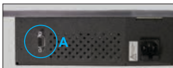
ClearChart 2 w/ serial port at bottom left corner

NOTE: Current models of ClearChart 2 have the serial port located at the bottom left corner of the unit, while older models have the serial port located toward the bottom center of the unit. Please take a moment to identify the serial port location.