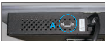
ClearChart 2 w/ serial port at bottom center

NOTE: If the serial port is located at the bottom left corner, you will need to connect the Right Angle Serial Adapter 7 for easier cable management before continuing.