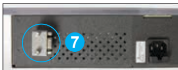
ClearChart 2 w/ serial port at bottom left corner plus Right Angle Serial Adapter 7

NOTE: If the serial port is located at the bottom left corner, you will need to connect the Right Angle Serial Adapter 7 for easier cable management before continuing.