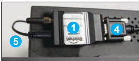
Top left corner of ClearChart 2.

For easier USB port accessibility a Flexible USB Adapter 6 is supplied. If desired, Cable Tie Mounts and Cable Ties are provided to secure the USB power cable or hide it from view.