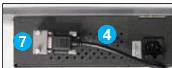
ClearChart 2 w/ serial port at bottom left corner

Continue connecting ClearChart 2 to the Wireless Dongle by plugging in the Extension Cable 4 into either the Right Angle Serial Adapter 7 or directly into the serial port (A) – depending on model.