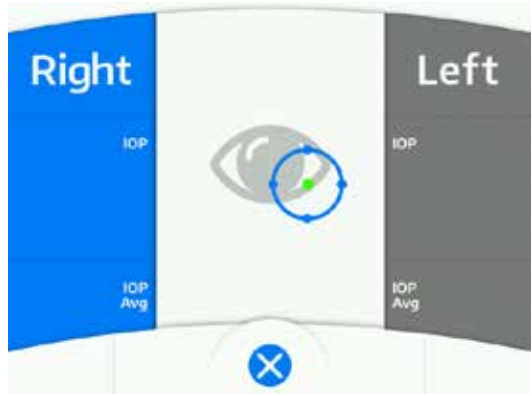
Measurement Process on LCD Screen