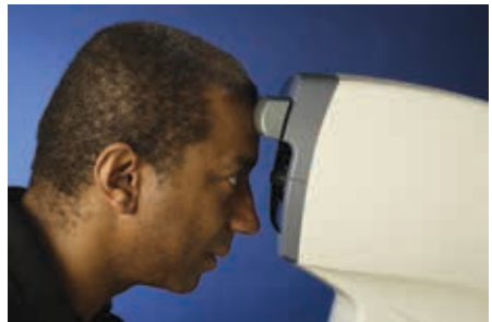
Improper patient alignment (chin moved away from unit)