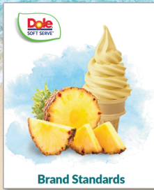
Brand Standards Guide