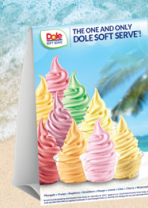
Table Tents 4in x 6in