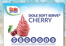
Flavor Tags 7in x 5in