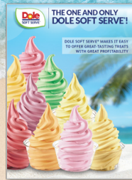
Full Line Brochure